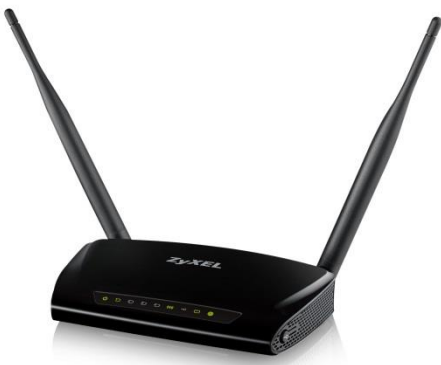
AMG1302-T10C Wireless N ADSL2+ Gateway

ZyXEL AMG1302-T10C comes equipped with essential ATM QoS features as well. Service providers can freely design their QoS policies and prioritize mission-critical services such as IPTV and VoIP based on their service plans. This increases network efficiency and productivity enable service providers to bring real multi-play into the daily life of residential users.